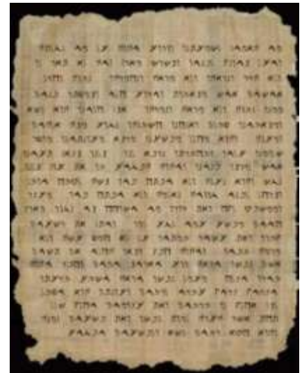
Ancient Text of Isaiah 53

“Who hath believed our report? and to whom is the arm of the LORD revealed? For he shall grow up before him as a tender plant, and as a root out of a dry ground: he hath no form nor comeliness; and when we shall see him, there is no beauty that we should desire him. He is despised and rejected of men; a man of sorrows, and acquainted with grief: and we hid as it were our faces from him; he was despised, and we esteemed him not. Surely he hath borne our griefs, and carried our sorrows: yet we did esteem him stricken, smitten of God, and afflicted. But he was wounded for our transgressions, he was bruised for our iniquities: the chastisement of our peace was upon him; and with his stripes we are healed. All we like sheep have gone astray; we have turned every one to his own way; and the LORD hath laid on him the iniquity of us all. He was oppressed, and he was afflicted, yet he opened not his mouth: he is brought as a lamb to the slaughter, and as a sheep before her shearers is dumb, so he openeth not his mouth. He was taken from prison and from judgment: and who shall declare his generation? for he was cut off out of the land of the living: for the transgression of my people was he stricken. And he made his grave with the wicked, and with the rich in his death; because he had done no violence, neither was any deceit in his mouth” (Isaiah 53:1-9).