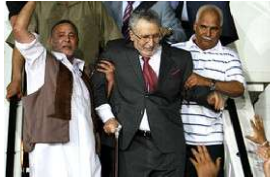
Abdel Baset al-Megrahi Returns to Libya

On August 20, 2009, Gaddafi negotiated the release of the Libyan terrorist Abdel Baset al-Megrahi who was convicted of bombing Pan Am Flight 103, on which 270 people died over Lockerbie, Scotland more than two decades ago.