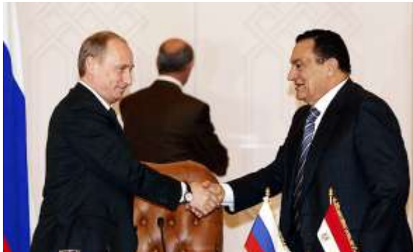
Putin & Egyptian President Hosni Mubarak

In February 2005, Putin sent Russian troops to Sudan. Russia's express purpose was to support "peacekeeping" efforts, but this was hardly truthful since Russia had been arming the radical Islamic regime in Khartoum for many years, as had the Iranians.