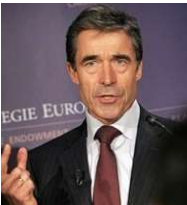
Anders Fogh Rasmussen NATO CHIEF

One of the most significant recent events to occur is the joint-military exercises involving Russian, Iran, Kazakhstan, Tajikistan, Uzbekistan, and China . Ezekiel’s prophecy, written thousands of years ago, is actually materializing in our day!