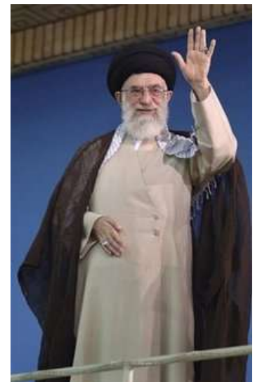
Ayatollah Ali Khamenei

The most powerful person in Iran, however, is not Ahmadinejad; it is Ayatollah Ali Khamenei . In 2009 Iran’s supreme religious leader warned Western governments of the “negative impact” over what he called “meddling” in the affairs of Iranian elections. This was a direct result of the riots that occurred when the 2009 Iranian presidential elections were thought to be unfairly conducted. Iranians rioted because the results of the elections gave Mahmoud Ahmadinejad another term in office. The Ayatollah accused Western governments, especially the USA and Great Britain, of encouraging these riots.