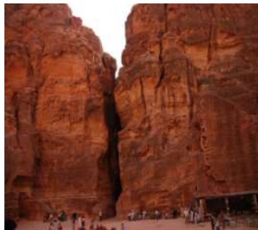
The Narrow Entrance of Petra

Where is this place that God will prepare for His remnant? According to God’s Word, the place will be located in the ancient land of Edom , near the city of Bozrah . The ancient Edomites dwelled in modern-day southern Jordan. There was an ancient city in that area called Bozrah . Today, there is a rock fortress located there called the Rose-Red City of Petra . Many Bible scholars believe this could be the place where God will preserve the Jewish remnant during the Battle of Armageddon. No one is certain, but all agree that this place fits the Biblical criteria and would provide good security for the remnant of Jews that will one day flee the armies of Antichrist!