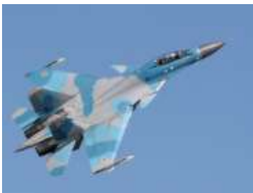
Russian SU-30 Fighter Jet

Gaddafi has also made deals with Russia for the purchase of SU-30 fighter jets, T-90 battle tanks, and other military arms. The newly formed relationship between Libya's Gaddafi and Russia's Putin is part of Russia's Islamic Initiative.