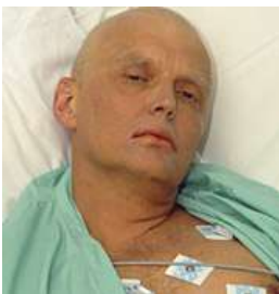
Alexander Litvinenko AFTER

“You may succeed in silencing me but that silence comes at a price. You have shown yourself to be as barbaric and ruthless as your most hostile critics have claimed. You have shown yourself to have no respect for life, liberty or any civilized value. You have shown yourself to be unworthy of your office, to be unworthy of the trust of civilized men and women. You may succeed in silencing one man but the howl of protest from around the world will reverberate, Mr. Putin, in your ears for the rest of your life. May God forgive you for what you have done, not only to me but to beloved Russia and its people.”