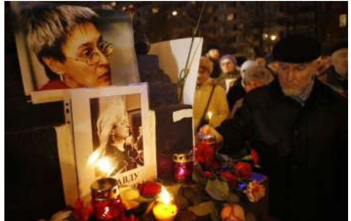
Russian Journalist Anna Politkovskaya Murdered

Since 1991, 220 Russian journalists have been murdered or died suspiciously. Of the 220 deaths, only five have been properly investigated according to Russian sources. Since 2000, when Vladimir Putin took office as President of Russia, 101 Russian journalists have been killed. Most of these journalists were opposed to the policies and procedures of Vladimir Putin.