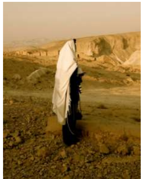
God's Chosen People - The Jews

Israel is God-ordained, God-decreed, God-conceived, & God-protected! God chose Israel “to be a special people unto Himself, above all people that are upon the face of the earth” (Deuteronomy 7:6). No other people have left a mark on history like the Jewish people. Though the Jewish people make up less than one half of 1% of the world’s population, they have won 33% of all Nobel Prizes . Someone said that the six most influential men of all time are Jesus, Moses, Paul, Karl Marx, Sigmund Freud, & Albert Einstein. The one thing all of these men have in common is that they are all Jews!