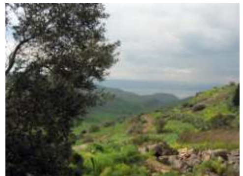
The Golan Heights

Ezekiel 38:8 says. “ After many days thou shalt be visited: in the latter years thou shalt come into the land that is brought back from the sword, and is gathered out of many people, against the mountains of Israel, which have been always waste: but it is brought forth out of the nations, and they shall dwell safely all of them. ” Ezekiel 39:2 states, “ And I will turn thee back, and leave but the sixth part of thee, and will cause thee to come up from the north part, and will bring thee upon the mountains of Israel. ”