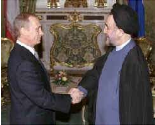
Putin & Mohammed Khatami

other trade deals. As if Putin were working his way through the list of countries prophesied by Ezekiel, Putin then expanded his Islamic Initiative beyond Iran.