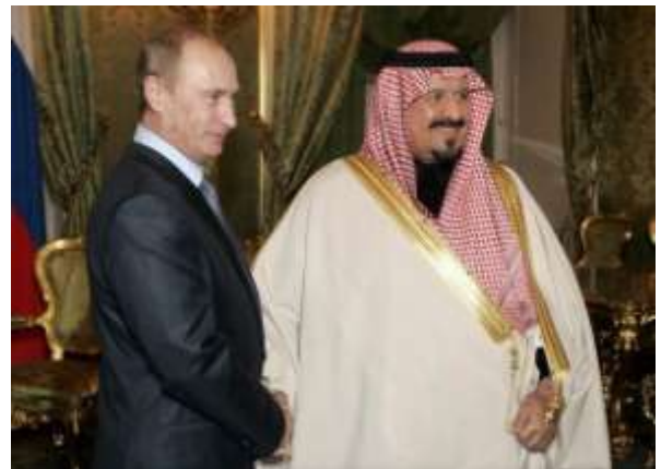
Putin & Abdullah Ibn Abdul Aziz

In September of 2003, Putin welcomed Saudi Arabia's crown prince Abdullah Ibn Abdul Aziz to Moscow. This was the first visit of such a high ranking Saudi leader since 1932. One reason for the tattered relationship between Russia and Saudi Arabia was that the Saudis channeled billions of dollars to the Mujahedin of Afghanistan to defeat the USSR after their 1979 invasion. Another reason was because the United States had military bases in Saudi Arabia at the time. This meeting between Russia and Saudi Arabia was, therefore, historic. They signed new trade deals and discussed regional security and future arms agreements.