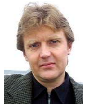
Alexander Litvinenko BEFORE